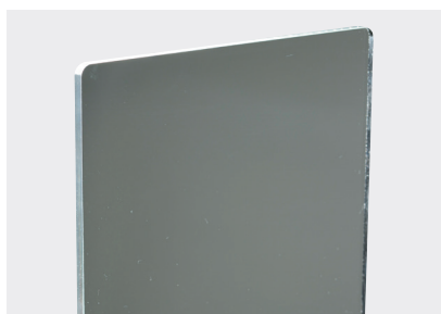
Acrylic glass pane treated with Plexistar Pro The pane remains in optimal condition.