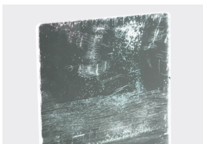
Acrylic glass pane treated with conventional glass cleaner or alcohol-based cleaner Stress cracks develop, which reduce the lifetime of the pane.